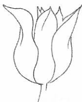
Tulip - Lily