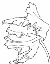
Tulip - Parrot