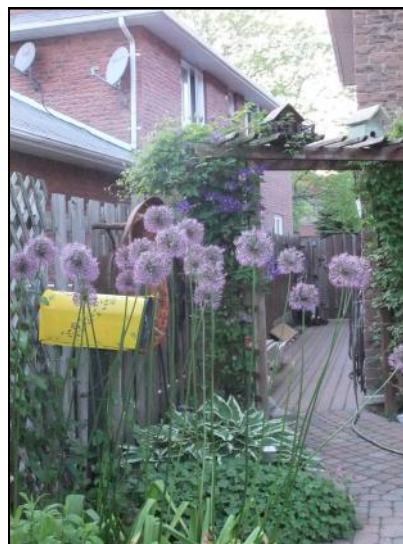
See this garden on the June 24th Garden Tour!

For more information, contact Sherry Howard at 905-668-7640 or howard21@rogers.com