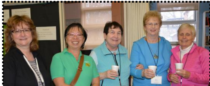
Members enjoying refreshments before the April meeting.