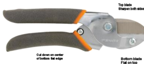
Photo: Garden Tool Maintenance

The last tool to get ready is you! Start an exercise program, stretch those gardening muscles and get yourself in shape and ready for the season.